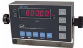
2100 Digital Indicator