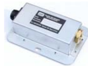
98051 Single Port Digital Air Sensor